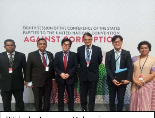
With the Japanese Delegation

35. At the bilateral meeting held with the Japanese delegation, it was stressed that they do not place full reliance on law enforcement or punishment. Instead they stated that from early school days the children are taught good manners, values including respect towards your neighbours,